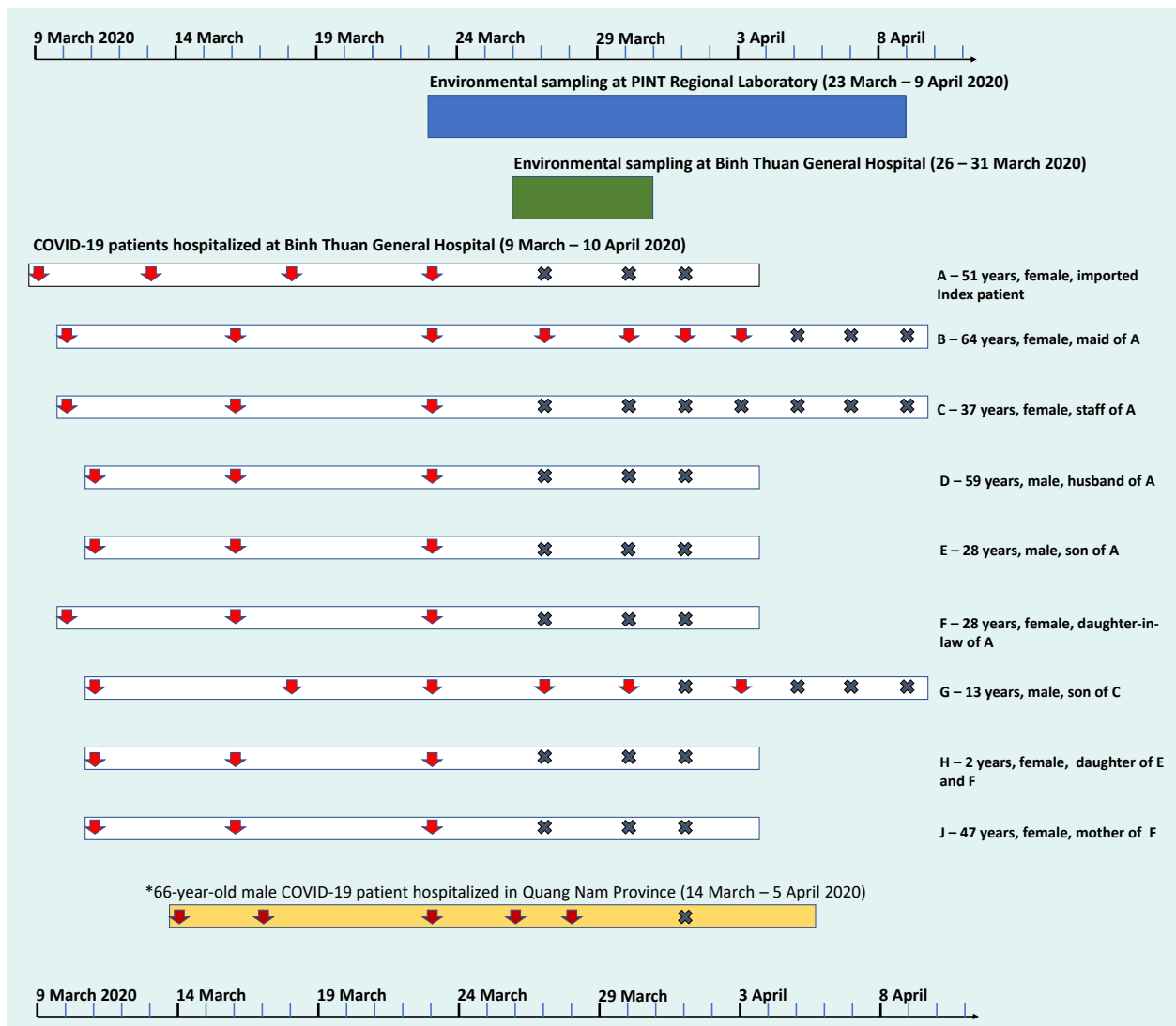
Fig. 2. Timeline of hospitalization of COVID-19 patients at the Binh Thuan General Hospital and sampling of environmental surfaces at the Pasteur Institute of Nha Trang (23 March–9 April 2020) and the general hospital (26–31 March 2020). Red arrows indicate patients' positive SARS-CoV-2 specimens by date of collection and a grey X indicates a negative specimen. *Patient was an imported case not connected to the Binh Thuan cluster