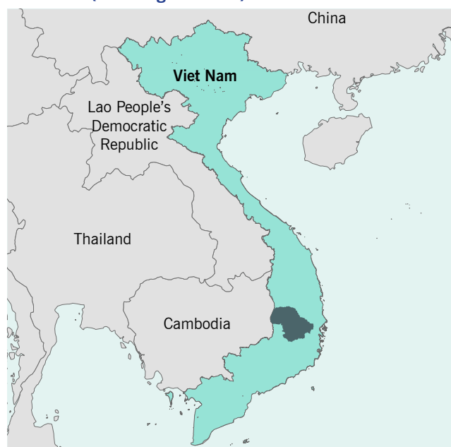
Figure 1. Map of Viet Nam showing Dak Lak province (in dark green area)