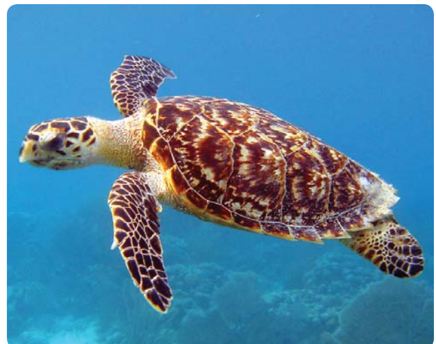
Figure 1. A typical hawksbill turtle