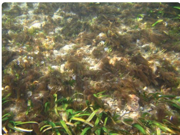
Figure 4. Abundant algae presumed to be Lyngbya majuscula , also known as “Mermaid’s Hair”

exception of the last category (four or greater). When stratified by age under 10 versus 10 and above, the dose response was similar (data not shown).