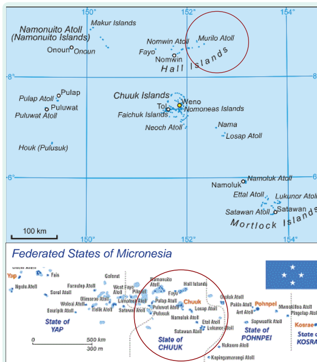
Figure 2. Location of Murilo, Chuuk State, Federated States of Micronesia