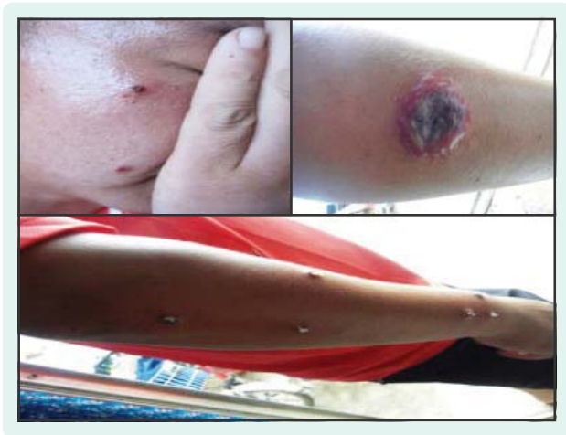
Figure 1. Lesions on the face, right arm and leg, Banlu village, China, July to August 2012

Of the five confirmed cases, three were confirmed by PCR from eschar specimens (Case 1, Case 2 and Case 4), one by gold colloid method from a blood specimen (Case 6) and one (Case 7) by blood smear, PCR and gold colloid method (Table 1).