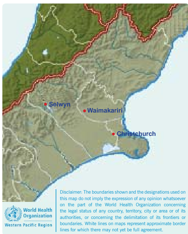
Figure 1. Districts for which a state of emergency was declared, 2010 Canterbury earthquake

were tested with field staff in the Canterbury region. Potential risks were prioritized and risk management options identified. Risk assessors and risk managers worked collaboratively in identifying risks, assessing likely impacts and deciding which risk management options to apply.