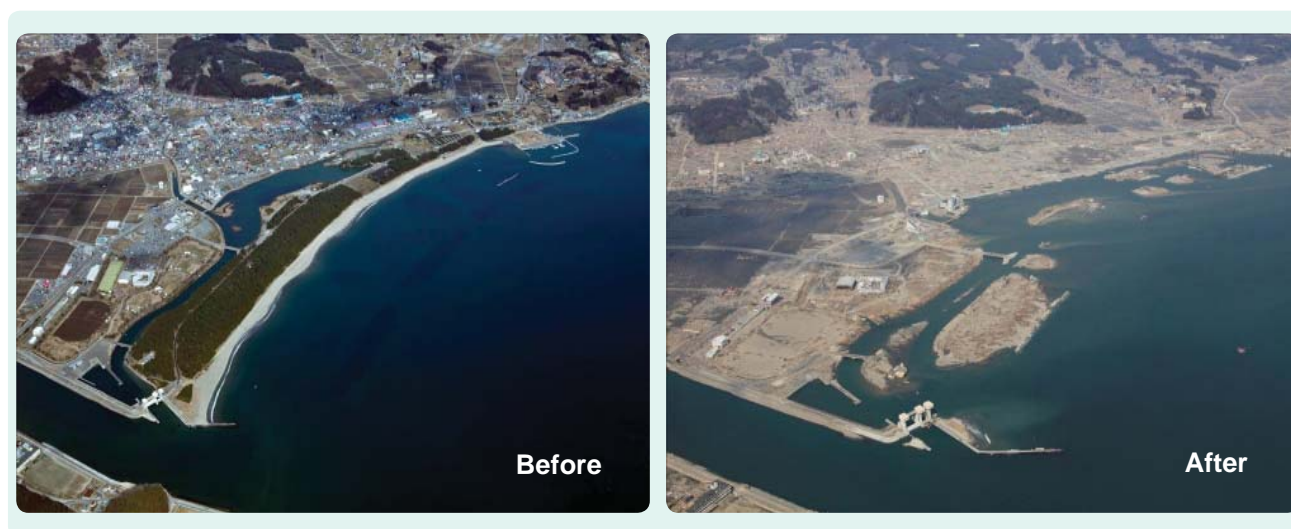
Figure 1. Rikuzen-takata City before and after the disaster*