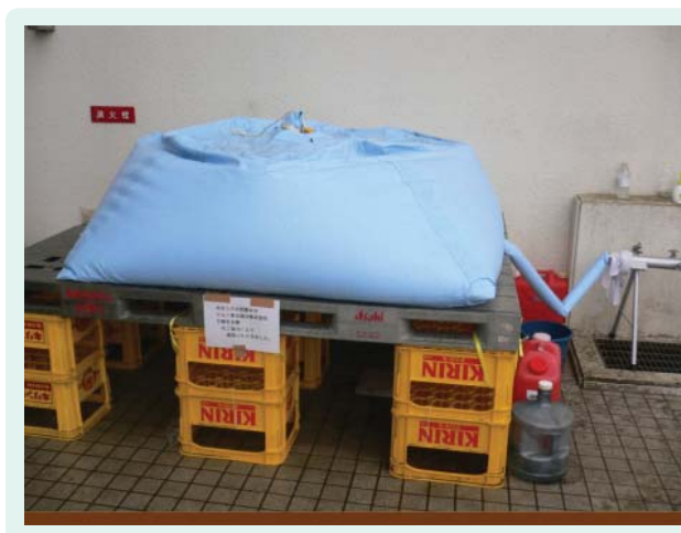
Figure 3. Water supply system

applied. With the total cooperation of the international relief department of the Japanese Red Cross Medical Treatment Center, simple hand-washing facilities were set up at 11 shelters selected from assessment results. These consisted of cloth storage tanks filled with water and connected to a pipe with a spigot (Figure 3). As of 30 September, there had been no outbreak of contamination or proliferation of communicable disease in the Ishinomaki medical district.