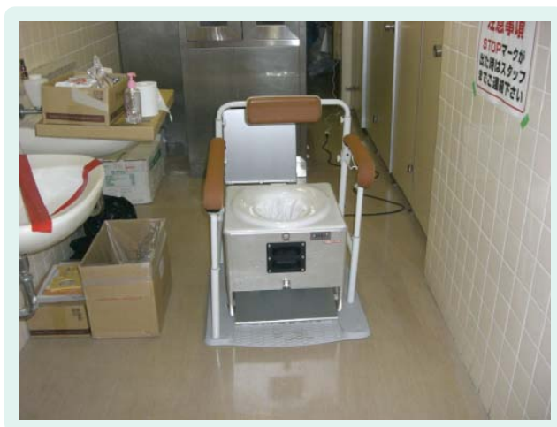
Figure 2. Wrap-type toilet used in evacuation centres

patients with symptoms and various tendencies. Initial assessments revealed that 35 emergency shelters lacked a sufficient food supply and that 100 shelters were contaminated by sludge and dust and had unsanitary conditions such as toilets that could not flush because of damage to the water and sewerage systems.