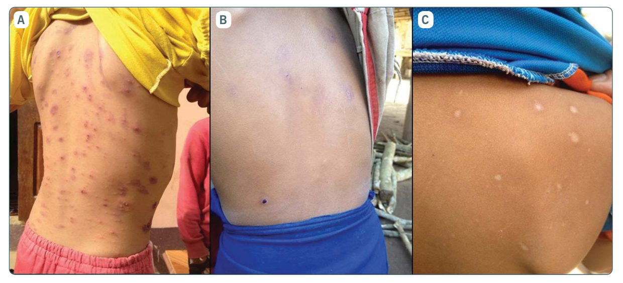
A: blistering phase; B: scabbing phase; and C: scarring phase.

Figure 2. Cases with different phases of vesicular rash in the fever and rash outbreak in Pakseng District, Luang Prabang Province, the Lao People's Democratic Republic, December 2014 to January 2015