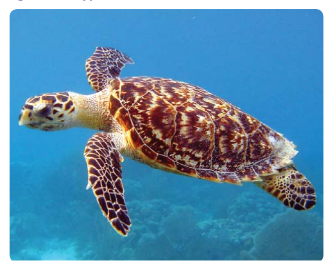
Figure 1. A typical hawksbill turtle