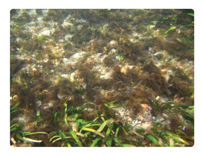
Figure 4. Abundant algae presumed to be Lyngbya majuscula, also known "Mermaid's Hair"

exception of the last category (four or greater). When stratified by age under 10 versus 10 and above, the dose response was similar (data not shown).